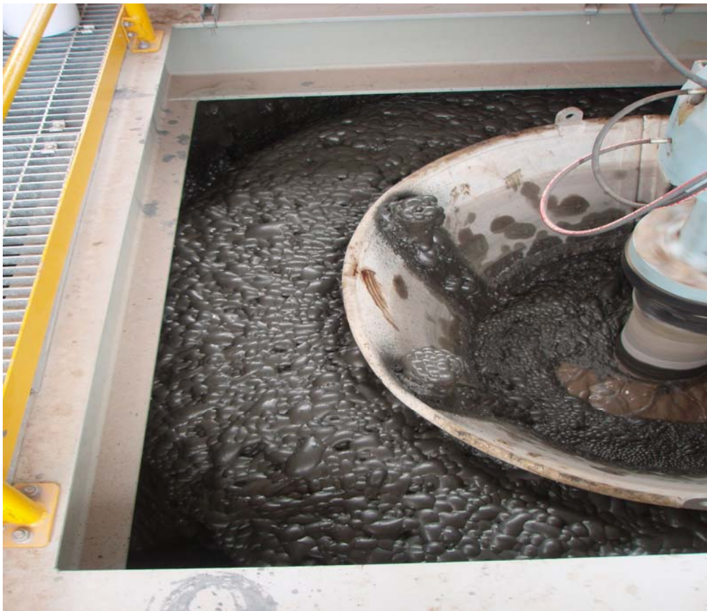
Bubbles of copper-gold concentrate being floated in a rougher cell

Trucking of concentrate to Sriracha Harbour in Thailand will commence in early May. Sriracha Harbour is the largest deep sea port in Thailand and is located approximately 120 kilometres south of Bangkok. The Company has storage facilities at Sriracha for 25,000 tonnes of concentrate.